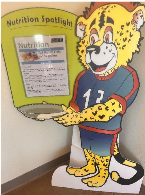
Nutrition promotion highlighting fall fruits and vegetables

47.8%, max: 78.3%) at baseline and 77.8% (min: 54.3%, max: 93.5%) at follow-up, with an average increase of 16.9% from baseline to follow-up. The highest average increase (+26.5%) in this domain was for AOI 20, Promoting Healthy Food and Beverage Habits.