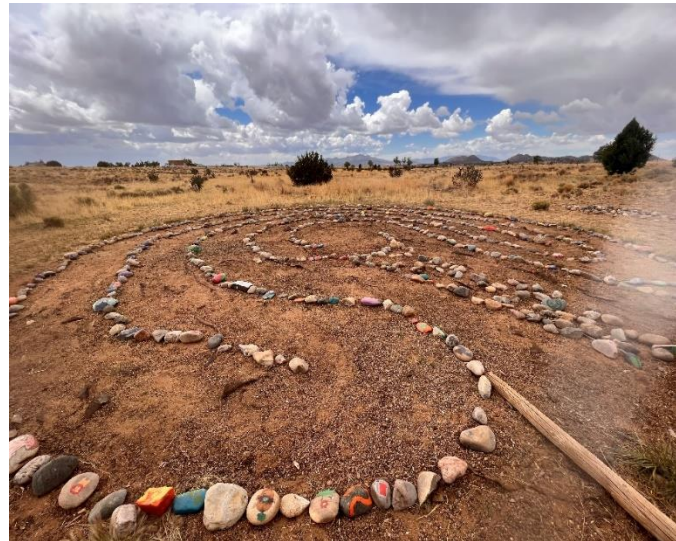
Meditation path at one elementary school

The purpose of this evaluation was to assess nutrition and physical activity policies, systems, and environments (PSEs) at NM schools served by SNAP-Ed NM implementing agencies and to compare 2022 data with 2018 data to determine the extent to which changes in PSEs occurred over time.