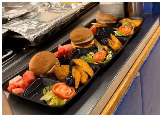
Elementary school lunch

In addition to this overall report, the SNAP-Ed NM Evaluation Team is providing reports for each participating school. The brief reports focus on assets and opportunities for potential PSE work within each school. The reports also highlight recommendations tailored for each school as well as potential resources for schools and IAs to use in their PSE efforts. The SNAP-Ed NM Evaluation Team will provide the reports to the IAs and will offer to present the findings virtually or in-person to participating school principals. Individual schools will determine if there are PSE strategies that they would like to implement in collaboration with SNAP-Ed NM IAs and/or with other community partners.