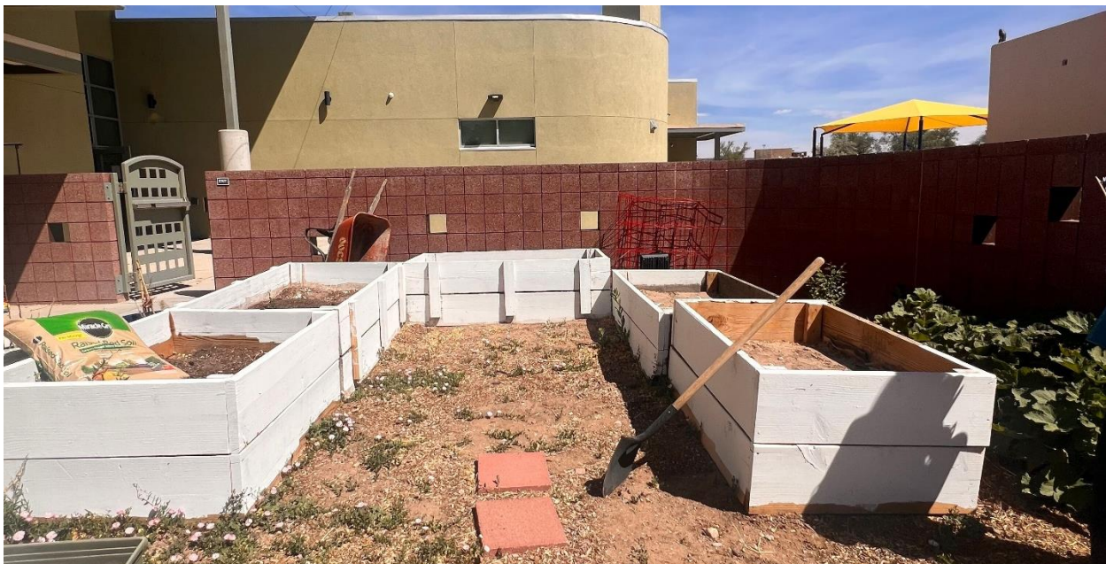
Raised bed for a school garden

Each criterion that was met was assigned a value of 1. The percentage of criteria that were met was calculated for each AOI for each school and averaged across schools for each domain (e.g., Physical Activity Physical Environment). The percentage of criteria that were met was then calculated for all physical activity domains and for all nutrition domains. Mean scores for each AOI were calculated across schools and transformed into a percentage representing the number of schools with each AOI met. The percentage of AOIs that were met in physical activity and nutrition categories were calculated for each school, resulting in an overall score for each school that represented the percentage of AOIs that were met. A paired samples t-test was used to assess differences between mean baseline and follow-up scores for each domain and category.